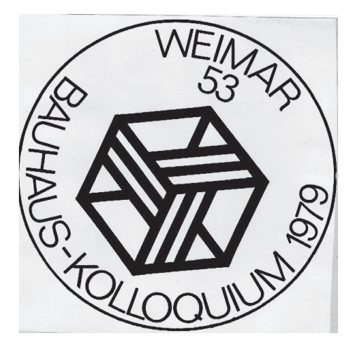
Fig.5 Bauhaus Kolloquium 1979; logo. AdM 26.1./0-1.