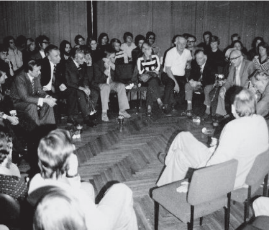
Fig.1 Bauhaus Kolloquium 1976; meeting with students in the Kasseturm. AdM 25.1./7-1. Fig. 2 Bauhaus Kolloquium 1976; trip to Bauhaus Dessau with the original Bauhäusler. AdM 25.2./1-3.

The results of the conference were published in a special issue of the Wissenschaftliche Zeitung der Hochschule für Architektur und Bauwesen Weimar.<sup>53</sup>