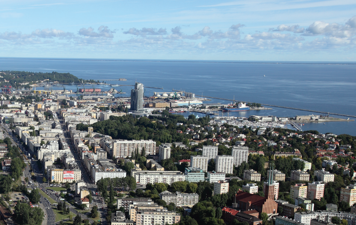
Fig. 10: View of the city center, 2010

for a long while the Central and Eastern European modern developments, into a relaxed, almost familiar atmosphere. Yet, this “family air” was neither exclusive, nor did it betray signs of another self-absorption inside larger geo-cultural borders within which new frustrations were surreptitiously taking shape. Quite the opposite, the Gdynia Conference knew no borders, be they physical or mental, to impede the dialogue with the “mainstream”, and Modernism was never tackled in binary terms such as Western-Eastern, or center-periphery, but as a free place of “multiple plurals”, as Edward Denison (London) posited.