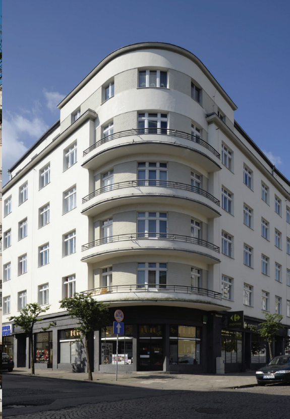
Fig. 8: Tenement house, Skwer Kościuszki (left)