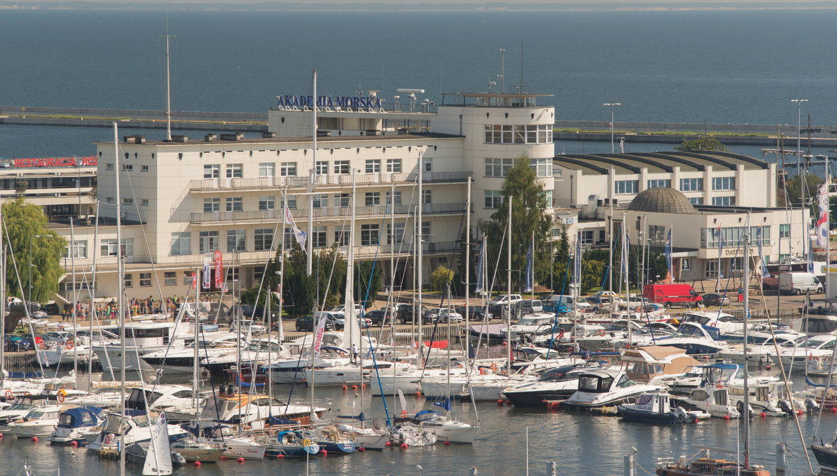
Fig. 2: Gdynia Maritime Academy on the South Pier (built 1938-1939), 2017

The first manifestations of Modernism appeared in the late 1920s and the 1930s, in relation to the operation of the port, and were located next to the wharfs and on the piers, next to such port infrastructure as various stevedoring facilities. Many constructions were erected, in which numerous foreign and domestic maritime trade companies invested. These constructions included port administration buildings, customs services facilities, office space and a large number of structures for food processing, and storage of goods – cold stores and silos. 6 Since the decisive factor in designing these buildings was their function and economic efficiency, practically all of them were given modernist forms, frequently as a simple reinforced concrete structures with the commonly applied red brickwork. (Fig. 3)