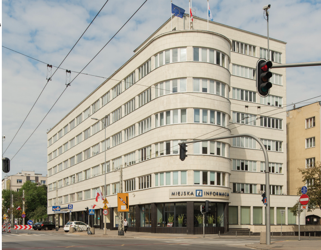
Fig. 6: Social Insurance Institution office building (built 1934-1936), now, Gdynia Municipality Office, 2017 Fig. 7: Polish Development Bank [Bank Gospodarstwa Krajowego] residential building (1935-1939), 2017